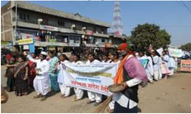
स्वच्छ भारत अभियान : स्वच्छता संदेश रॅली