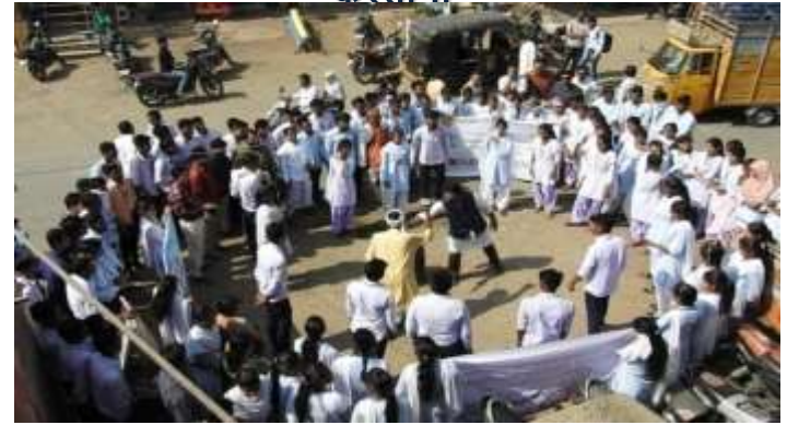
स्वच्छ भारत अभियान : विद्यार्थी पथनाट्य सादर करतांना