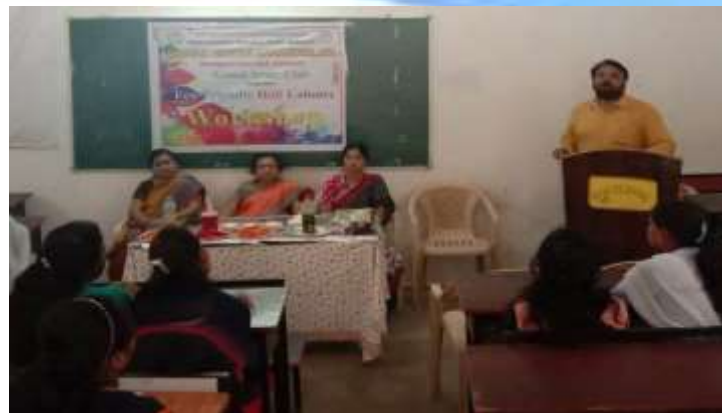
Workshop on Eco- Friendly Holy Colours