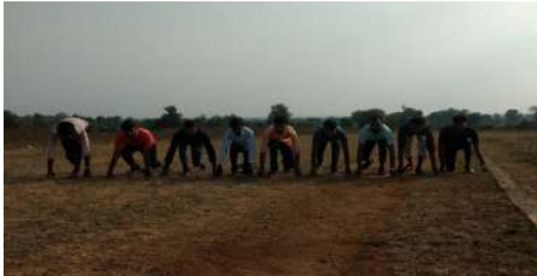
Sport Carnival 2020