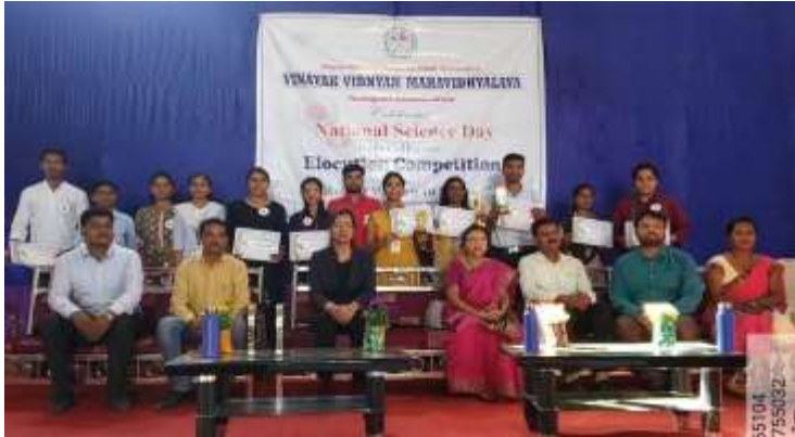
Elocution Competition on 'Role of Women in Science' on the occasion of National Science Day