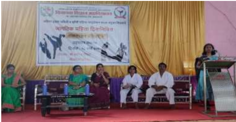
Self-Defense Training on the Occasion of International Women's Day