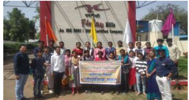
Industrial Visit : Students of Commerce department Visited to Finlay Mills