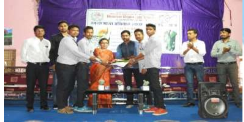
Poster and Model Competition on 'Best from Waste' :स्वच्छ भारत अभियान स्वच्छता पखवाडा -२०२०