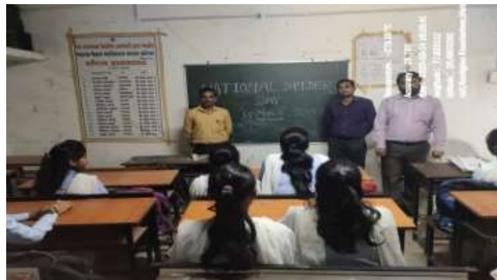
Interaction with Students on National Spider Day