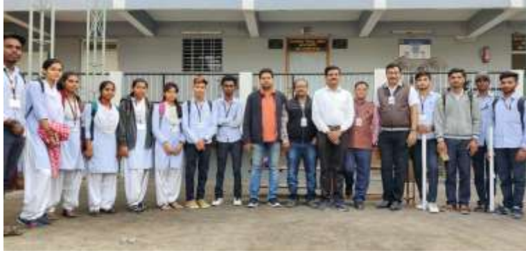
Student participate in university level Avishkar – 2020 at Bharatiya Mahavidyalaya, Amravati