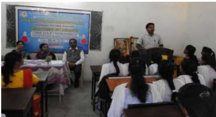
Workshop on Safety handling of Chemicals