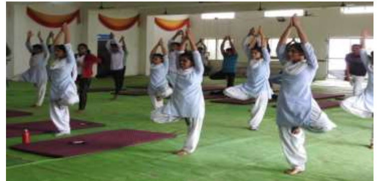
Workshop on Yoga