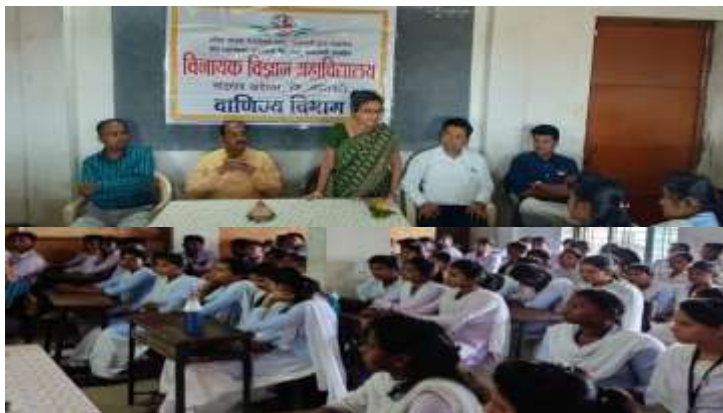
Guest Lecture: Commerce Department