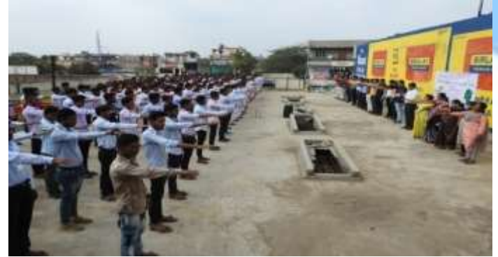
Student taking Oath on the occasion of Cleanliness Drive