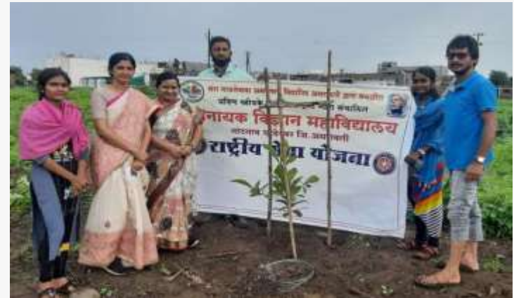
Plantation Drive: 26 July 2021