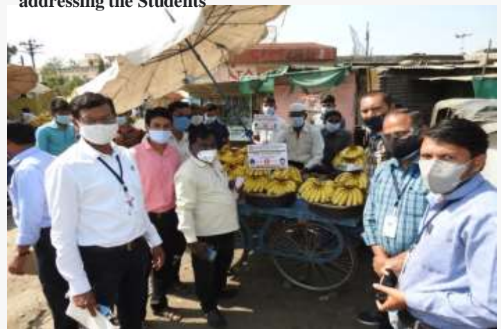
Covid-19 Awareness Programme: Mask Distribution