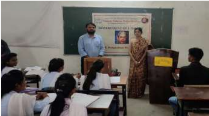
Celebration of 128 th Birth Anniversary of C. Rangnathan