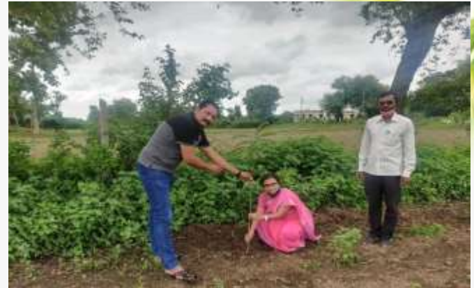
Plantation Drive: 26 July 2021