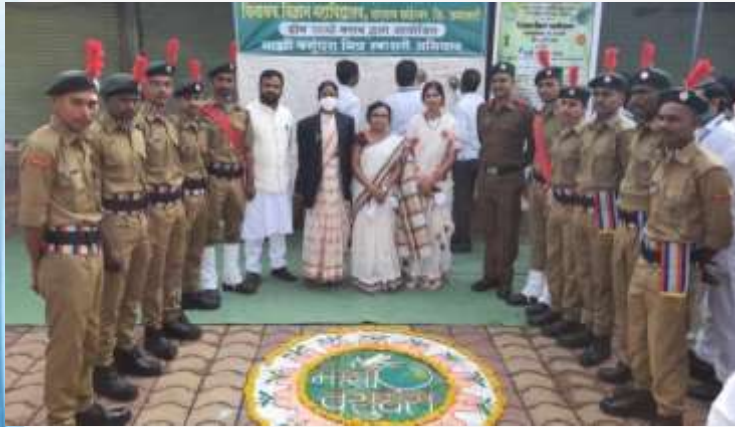
माझी वसुंधरा मित्र स्वाक्षरी अभियान : 26 January 2021