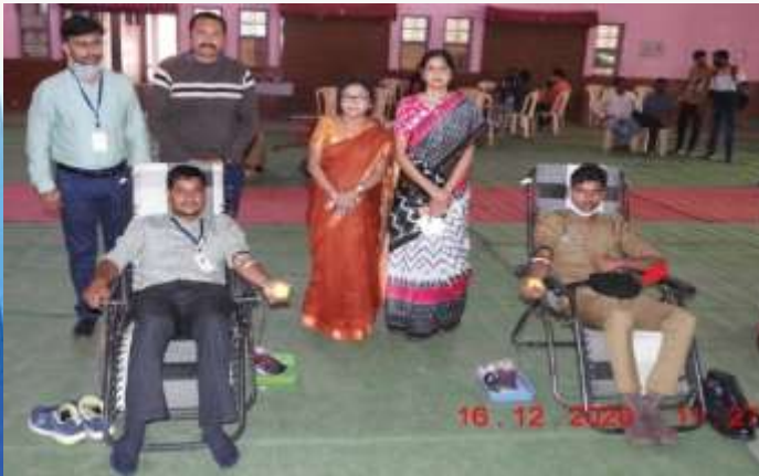
Organized Blood Donation Camp on 16 December 2020