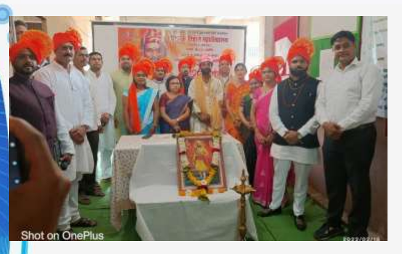
Honorable Principle and staff members during celebration of Shiv-Jayanti 2022