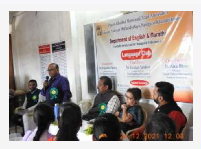
Inauguration of Language Club