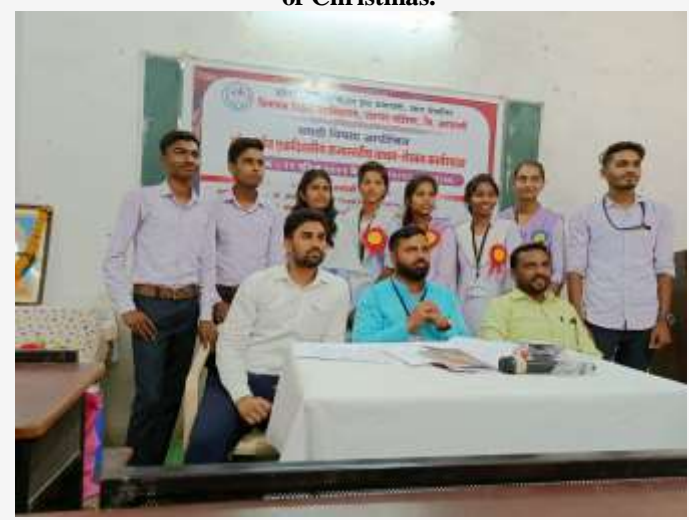
One day State Level online workshop on Reading and Writing.