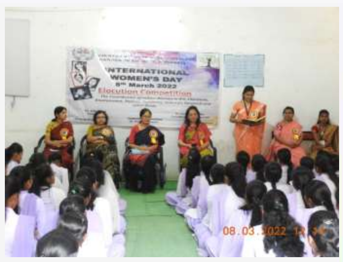
Inauguration of Sanitary Napkin Vending Machine and Celebration International Womens Day: 8 March