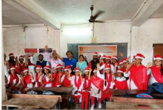
Students Celebrating o 'Christmas Carols' on the eve of Christmas.