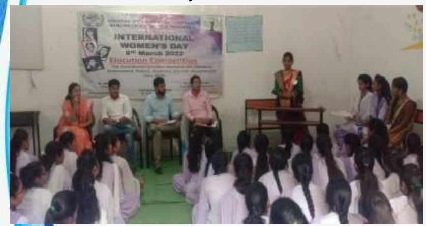
Student participation in an Elocution competition on the occasion of International Women's Day-2022