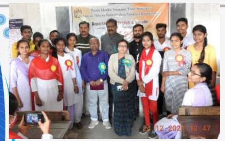
Inauguration of Language Club